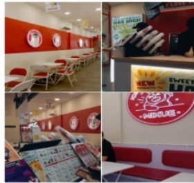
Figure2 Mixue Bengkalis

Figure 1 shows the Mixue Bengkalis distribution channel which is available online. The provision of this online distribution channel is very effective because the online distribution channel can make it easier for consumers to buy Mixue products without having to come directly to the store. While offline consumers can directly buy by coming directly to Mixue Bengkalis. Mixue provides a comfortable place with an air-conditioned room to relax and enjoy ice cream and drinks. Mixue Bengkalis is also very instagramable which is suitable for taking pictures.